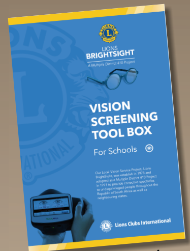
School Vision Screening Tool Box

Tool Kits are available on our website for Clubs to download that will assist in running successful sight projects: